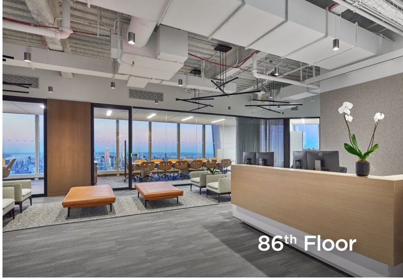
86 th Floor

Your clients have a vision. We can make it a reality. Find the right space here — and let us make it perfect.