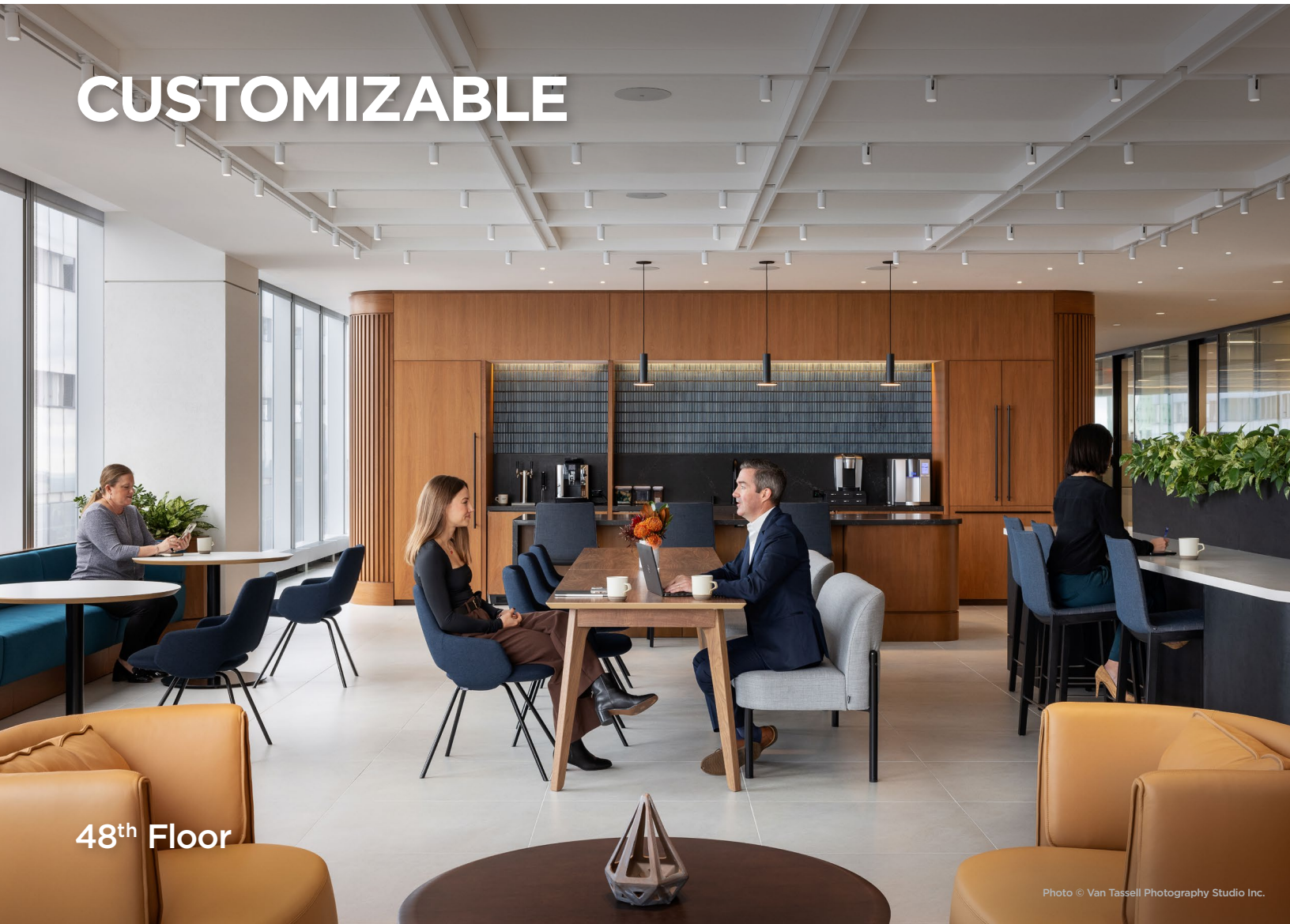
48 th Floor